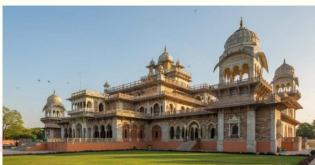
ALBERT HALL MUSEUM