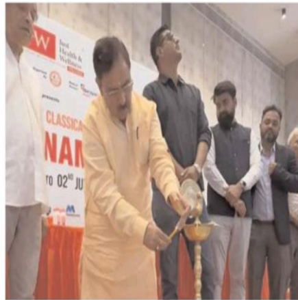
का. उसके बाद मैं राजनीतिज्ञ बना और अखिल भारतीय चैस महासंघ