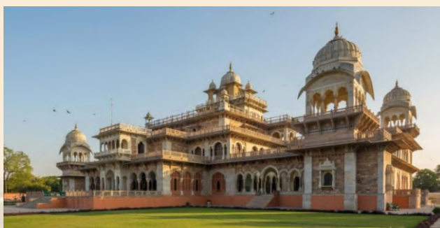
ALBERT HALL MUSEUM