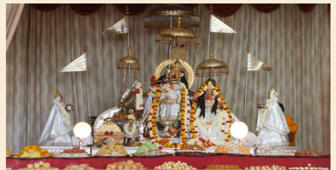
GOVIND DEVJI TEMPLE