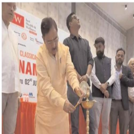
का. उसके बाद मैं राजनीतिज बना और अखिल भारतीय चैस महासंघ